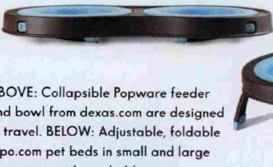
ABOVE: Collapsible Popware feeder and bowl from dexas.com are designed to travel. BELOW: Adjustable, foldable flipo.com pet beds in small and large sizes come with washable covers.